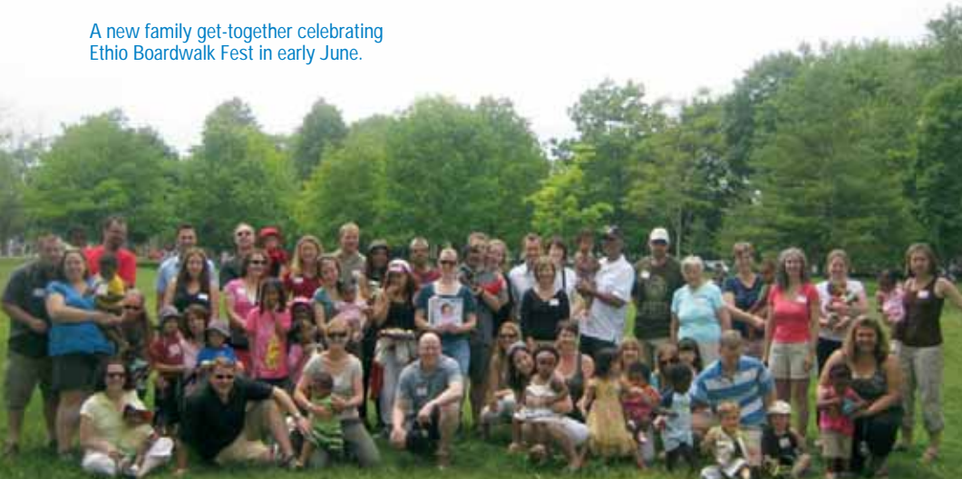
A new family get-together celebrating Ethio Boardwalk Fest in early June.

It seems that if every person took responsibility for one other person in this world, we could start a revolution. Every one of us can, in some way, become that needed adult in a child's life. For some, it might be parenting an orphaned or abandoned child. For others, it can be sharing ideas, skills and resources. Our contributions today serve as investments in the future potential leaders of tomorrow.